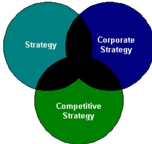
Figure 1 - Three Forms of Strategy