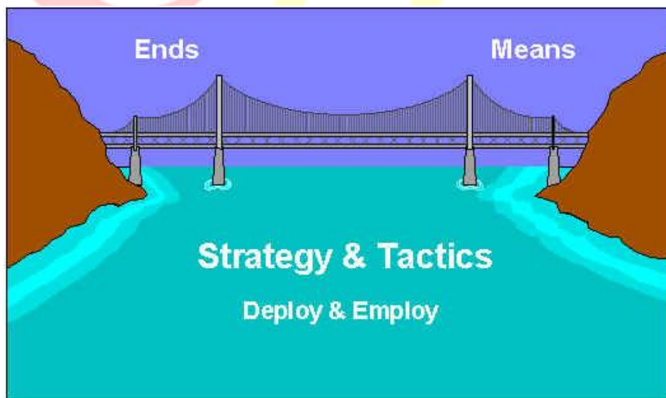
Figure 2 - "Bridging the Gap"

Strategy, in general, refers to how a given objective will be achieved. Consequently, strategy in general is concerned with the relationships between ends and means, that is, between the results we seek and the resources at our disposal. Strategy and tactics are both concerned with formulating and then carrying out courses of action intended to attain particular objectives. For the most part, strategy is concerned with deploying the resources at your disposal whereas tactics is concerned with employing them. Together, strategy and tactics bridge the gap between ends and means (see Figure 2).